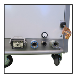
Double hose system for maximum performance