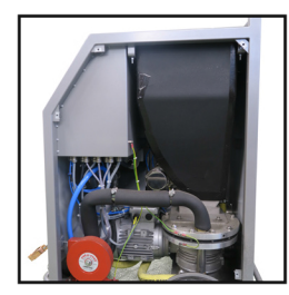
Optimum pellet flow thanks to maintenance-free electric vibrator