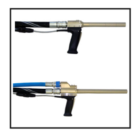
Optional 1- or 2-hose-system