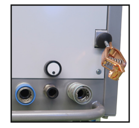
Integrated grounding roll for more safety